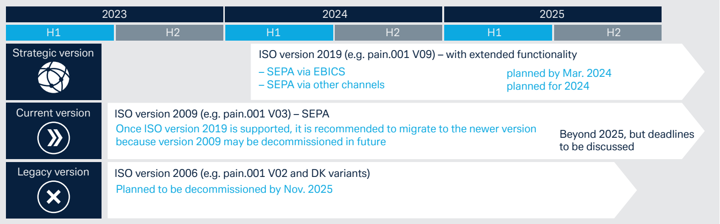
Figure 1: ISO XML version supported by Deutsche Bank AG

However, by the end of 2025, Deutsche Bank will discontinue ISO version 2006, which includes pain.001.001.02 and DK versions pain.001.002.02, pain.008.002.01, pain.001.002.03, pain.008.002.02, pain.001.003.03, pain.008.003.02.